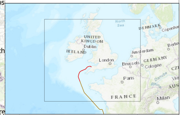
Figure Note: The 236km buffer is equivalent to the mean-max foraging range (plus one standard deviation) of lesser black-backed gull and has been used to determine potential connectivity between seabird colonies and the Study Area.